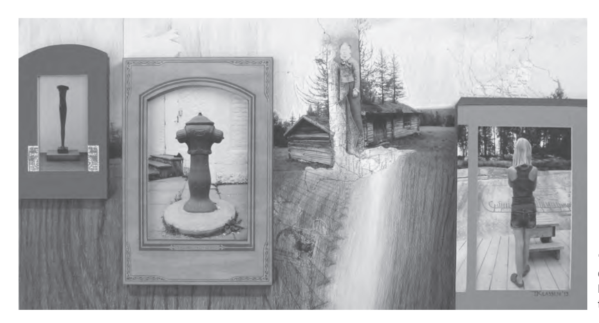
"Entangled Routes" exhibit runs from Friday, March 22 through June 23.