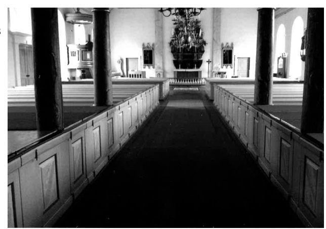
Nottebäck parish church

I took one last look at the lake as I drove away. The sun was setting and it is a view I will never forget. If you are researching your ancestors, I hope someday you will personally be able to experience this kind of journey of a lifetime.