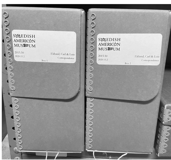
Newly designed labels on archival boxes ease the identification of material.