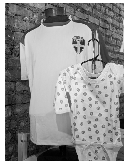
Swedish soccer jersey and a Sweden soccer ball onesie.