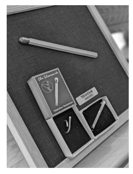
Sampling of the remaining Ola Silversmide Tildaholm Match Accessories