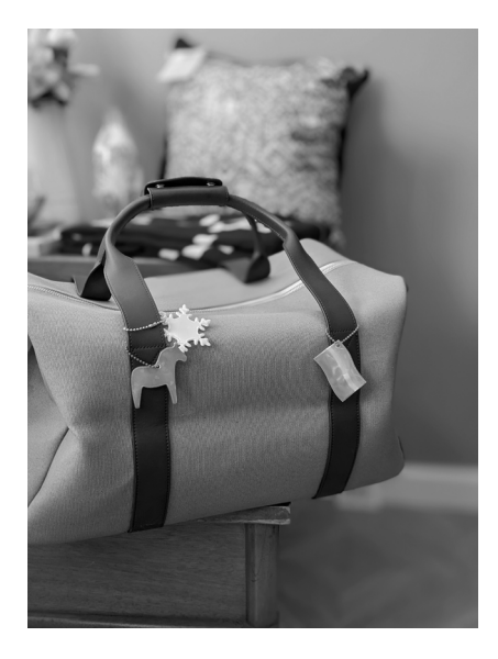
Three of our most popular funflectors: snow-flake, dala horse and pride flag.

The Museum Store now offers Swedish match boxes and a limited number of beautiful silver match accessories styled as rings, earrings, and tie tacks, which is soon to sell out.