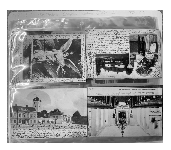
Fragile postcards are stored in polypropylene sleeves within an archival-grade folder to ensure longevity.

If you seek hands-on experience working with The Museum's archival collections, need advice about best caring for your family papers and photographs, or crave learning more about archiving, please reach out (llindstrom@samac. org).