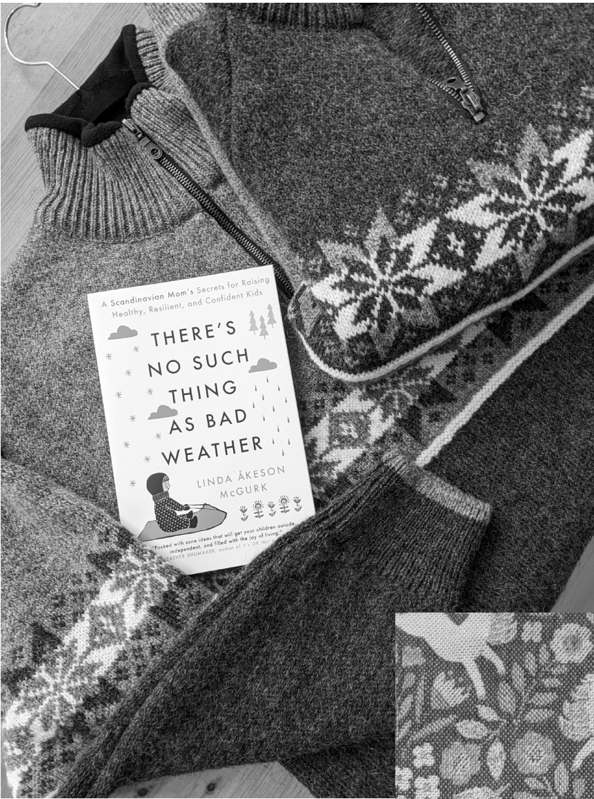
Norwool Sweater with a copy of There's No Such Thing as Bad Weather