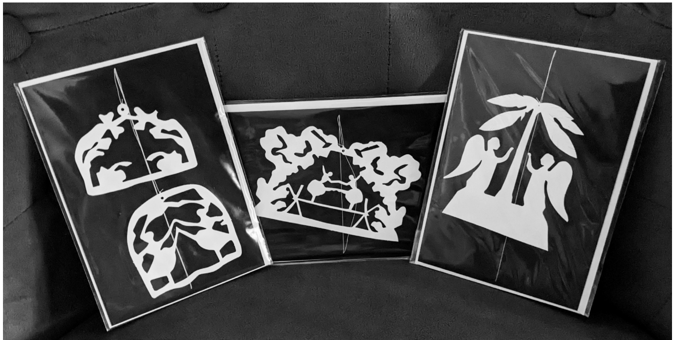
Three Hans Christian Andersen cutout designs: Swan Dancers, The Tightrope Dancer, and Palm Angels.

I learned that Hans Christian Andersen was a frequent party guest and would bring along paper and a pair of scissors. Andersen would then amuse guests by cutting small silhouettes from his fairy tales to distribute to his hosts, very Hygge . Replica cut-outs ($9) are available to remind us of the magical fairy tales that Andersen shared with the world