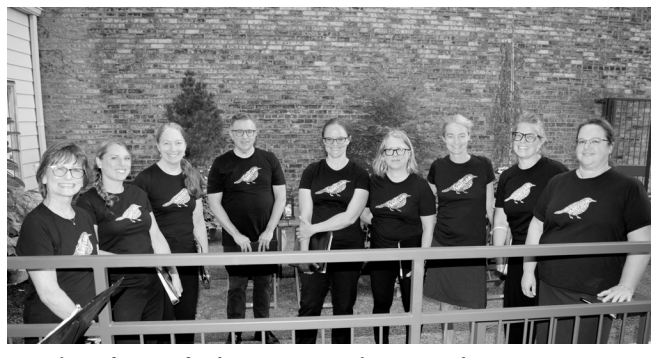
Merula performing for dinner guests in the courtyard