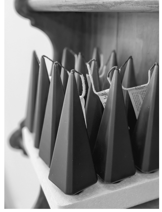
Tall Tomten Green Tree Taper Candles