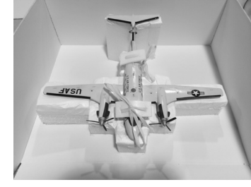
more arts and crafts with rehousing...

What happens after a proposed donation has been evaluated and accepted into a museum's permanent collection? The short answer is a lot of paperwork.