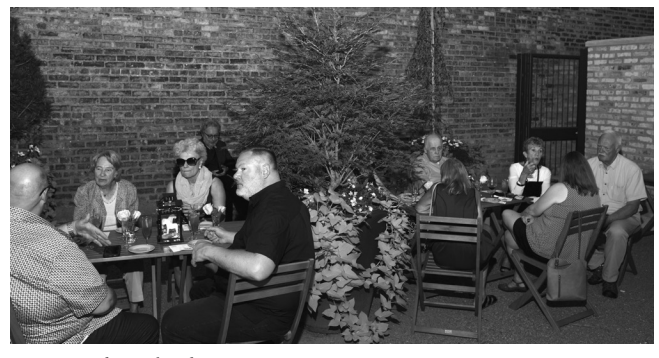
Guests at the cocktail party