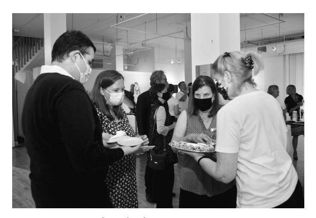
Joy serving guests at the cocktail party