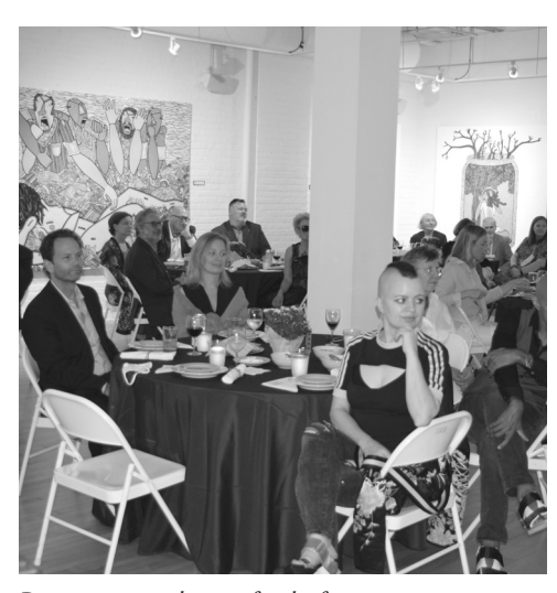
Dinner to pave the way for the future