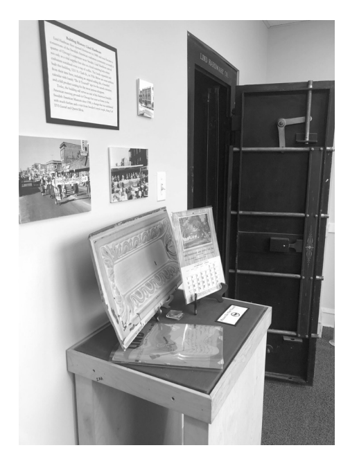
Andersonville through the ages

The "We Are America" revitalization will better address current community concerns, reflect updated scholarship and implement contemporary best practices for museum exhibitions. We will alter the architecture to create a single-entry point, meet Americans with Disability Act guidelines, improve visitor orientation and slightly expand the space. New sensory and interactive features will enliven the space and directly engage audiences with at least one offering the opportunity for community-created content. We will improve the protection and preservation of our artifacts by reducing the number in the exhibit and better protecting those on display.