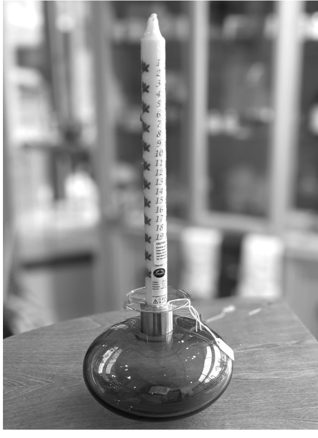
Advent Taper Candle