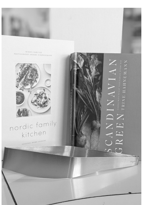
Cookbooks Nordic Family Kitchen and Scandinavian Green featuring the Perfect Cake Server by Magisso.