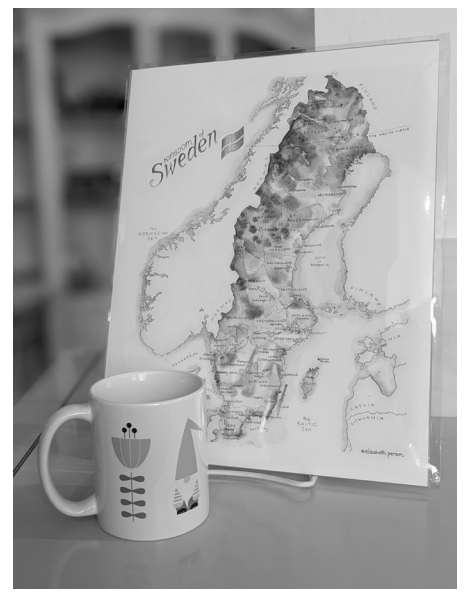
Watercolor Map of Sweden displayed next to a mug featuring a yellow flower and springtime gnome.

Our new New Nordic Cuisine exhibit made me eager to try out some new recipes. From Scandinavian Green, I am looking forward to adding several dishes into my meal plans, such as strawberry and cucumber salad (246), walnut and red pepper dip (60) and rhubarb soup with floating meringue (208). One thing I like about this cookbook is how author