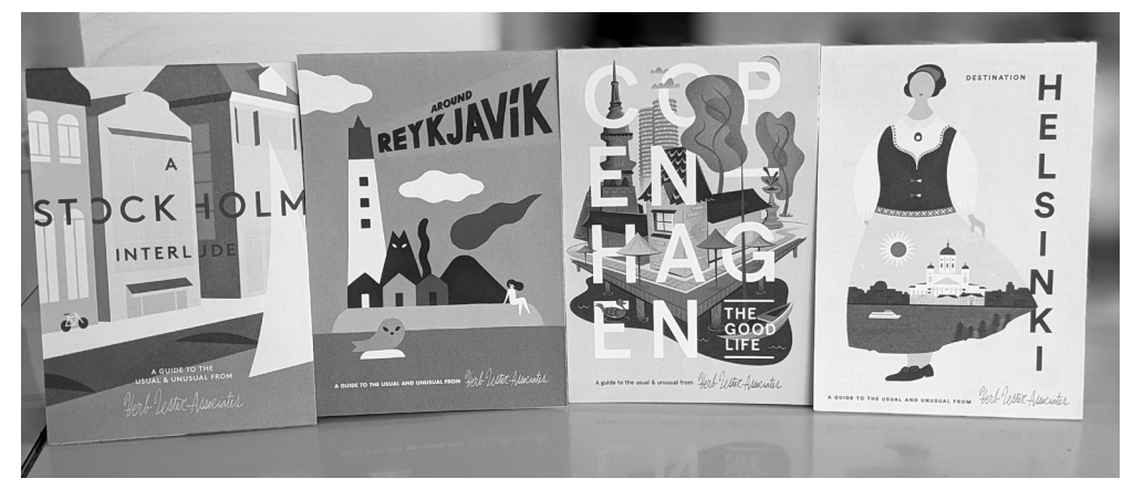
City Maps of Stockholm, Reykjavik, Copenhagen and Helsinki.

You may have noticed that the Museum Store Children's section has grown significantly lately. This is because the Museum Store is now an approved BRIO vendor. The story of BRIO begins in 1884 with a boy named