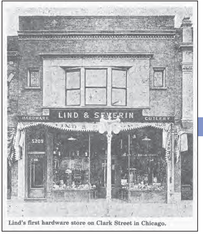
Lind & Severin Hardware relocated in 1909 from Oak Street to the storefront at 5209 N. Clark in Andersonville. In 1927, it moved next door to the then-new three-story building that has been occupied since 1988 by the Swedish American Museum.

On May 1, 1987, the Swedish American Museum board completed the purchase of the Lind building for $200,000 and began to restore it as the future home for its expanding collection, which had been archived in cramped quarters at 5248 N. Clark since