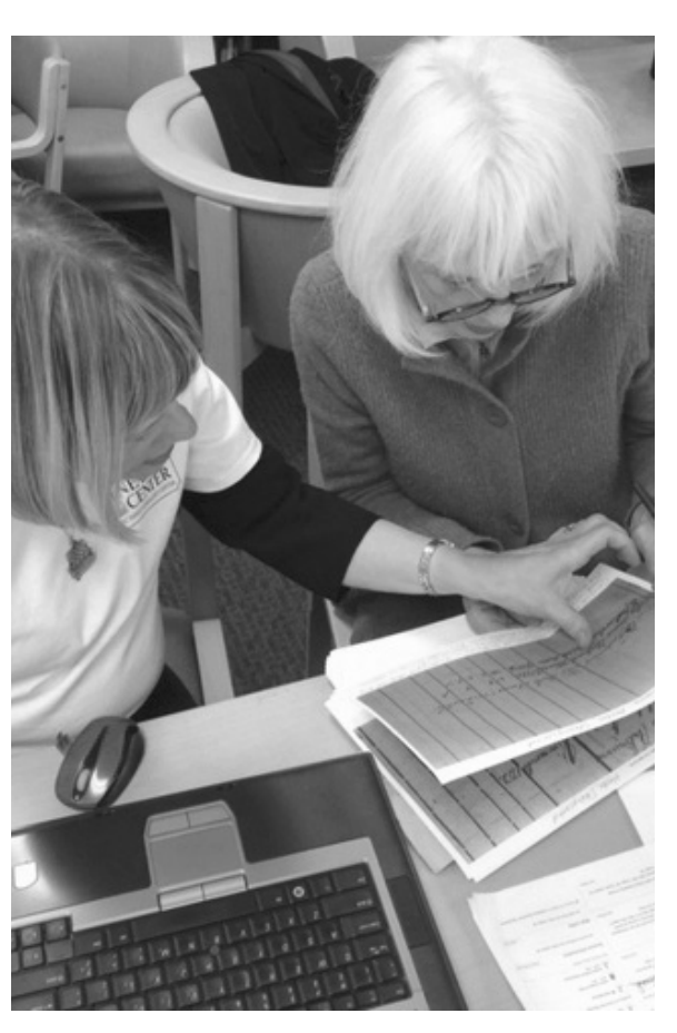
Water Tower Fund