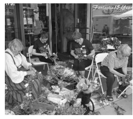
Making of flower wreaths 2017