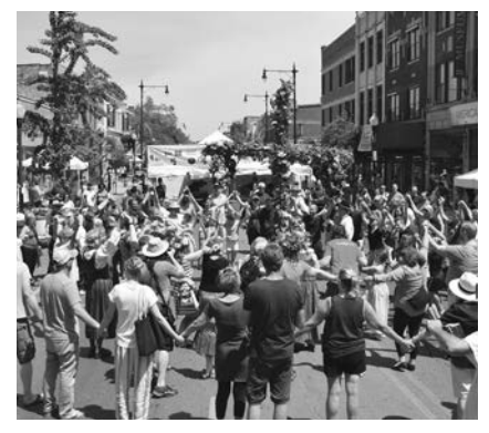
Dancing around the May Pole at Midsommarfest