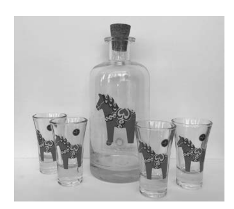
Dala Horse carafe and schnapps glasses

We in the Museum Store see it as our role to help you make it easy to celebrate your Swedish and Scandinavian traditions and ideas. No matter if it is the final touch of a tooth picked Scandinavian flag on top of your cake, or a new way of serving our Swedish classics, we in the Store are here to help. So come on by and get inspired!