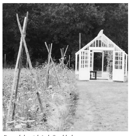
Rosendals trädgård, Stockholm

following the 1871 Chicago Fire. He also planted all the trees for the 1893 World's Fair.