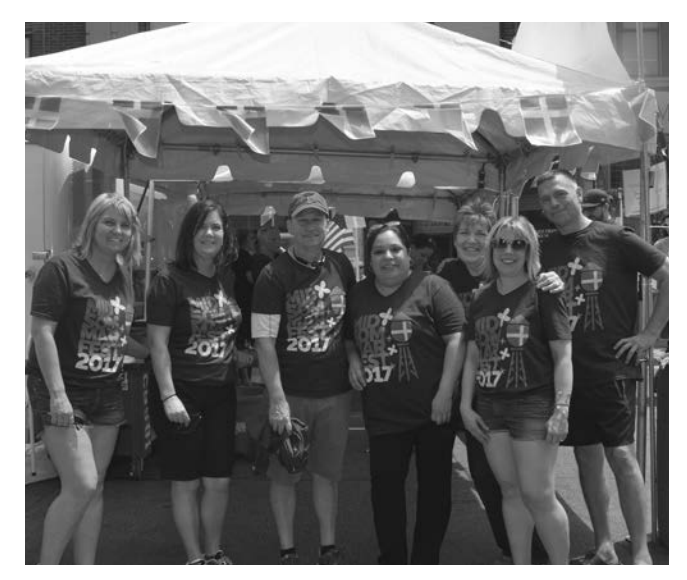
Volunteers at Midsommarfest 2017

we return to upcoming volunteer opportunities. A major one was mentioned above, Midsommarfest. This is one of the biggest and arguably most fun chances for new, current and 'old' volunteers to kick off the summer! For those who are not familiar with the event, Midsommarfest is a street festival held just outside the Museum extending a few blocks to the north up Clark Street. The Museum joins forces with the neighborhood by sharing Swedish Midsommar traditions, music, and much more. As you can imagine, this