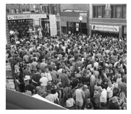
ABBA salute at Midsommarfest 2017