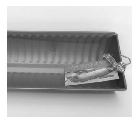
Almond cake pan