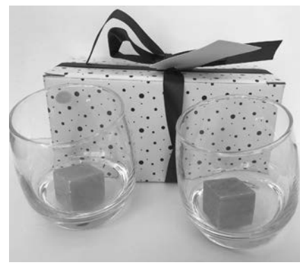
Sagafors rocking tumblers with drink stones