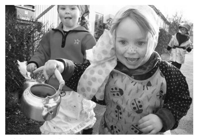
Kids dressed up as witches

lunch, children will go on a treasure hunt looking for Easter eggs filled with candy. At dinner, people eat lamb with potato gratin and a side salad.