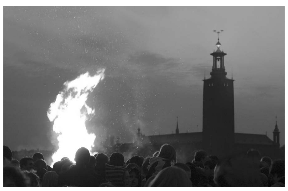
Walpurgis (Valborg) bonfire

Served hot with hardboiled eggs and a dollop of Crème Fraiche.