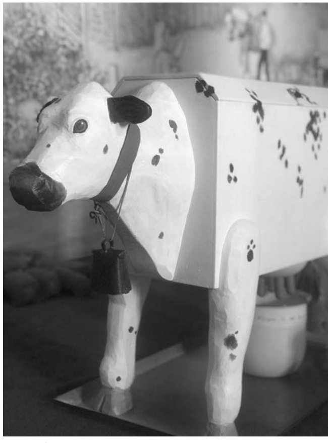
Moomor the cow

You move on to check on your animals. The mama pig and her babies grunt "nöff, nöff" at the sound of your footsteps, hoping you are bringing a tasty treat. You nuzzle your head against your sweet cow, Moomor, as