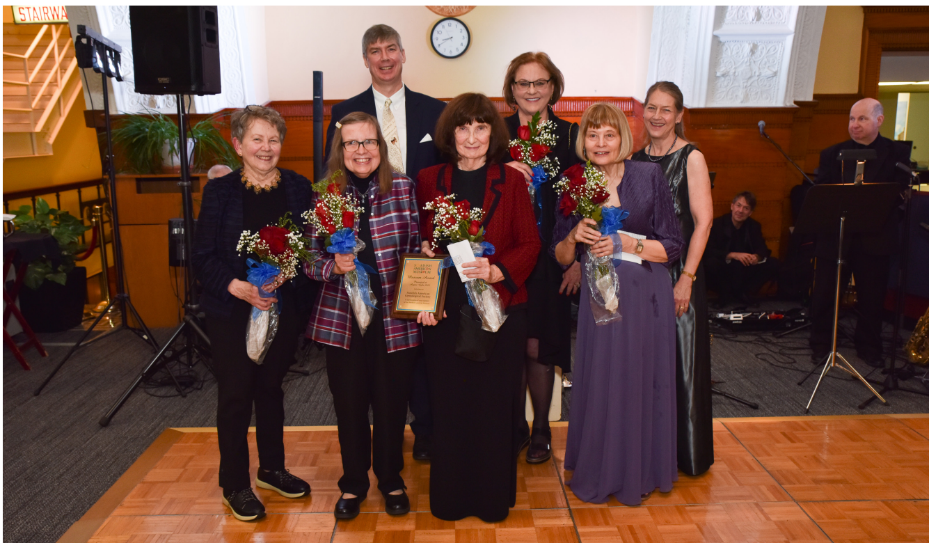
Genealogy Advisory Board