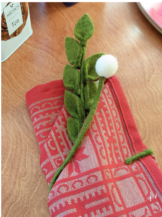
A white felted flower pom intertwined with a green leaf branch folded into an Ekelund hand towel.