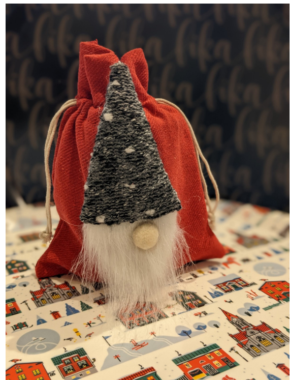
Plush Tomte on Red Gift Bag