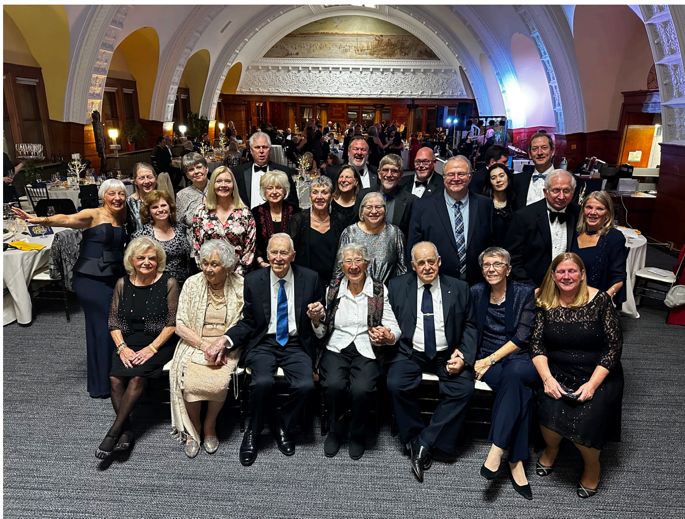
Members of Verdandi Lodge #3 I.O.S.